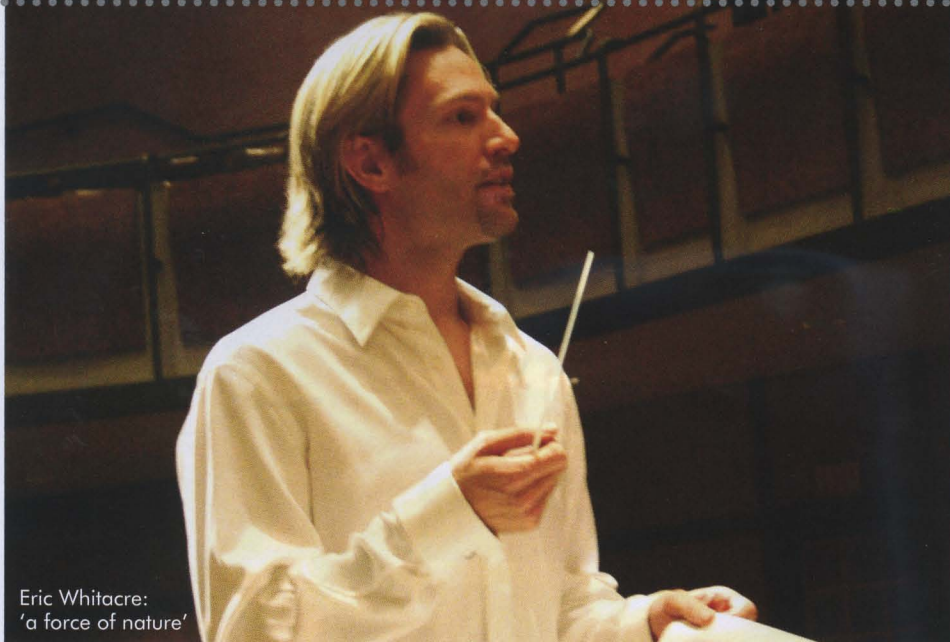
Eric Whitacre: 'a force of nature'

was trying to make him happy and find my own voice in there. And then at some point I think I just surrendered, you know? This is what I do and this is what I like to listen to and I just have to do it. And I think it helped that I was having some success. Even at Juilliard I was being commissioned. I had real pieces to write for real people. And there's a real pragmatism that comes into play there.